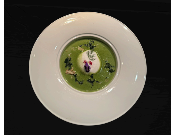
ASPARAGUS SOUP 芦笋汤

Seared scallops, Ikura. 红烧扇贝, 鲑鱼子 THB 490