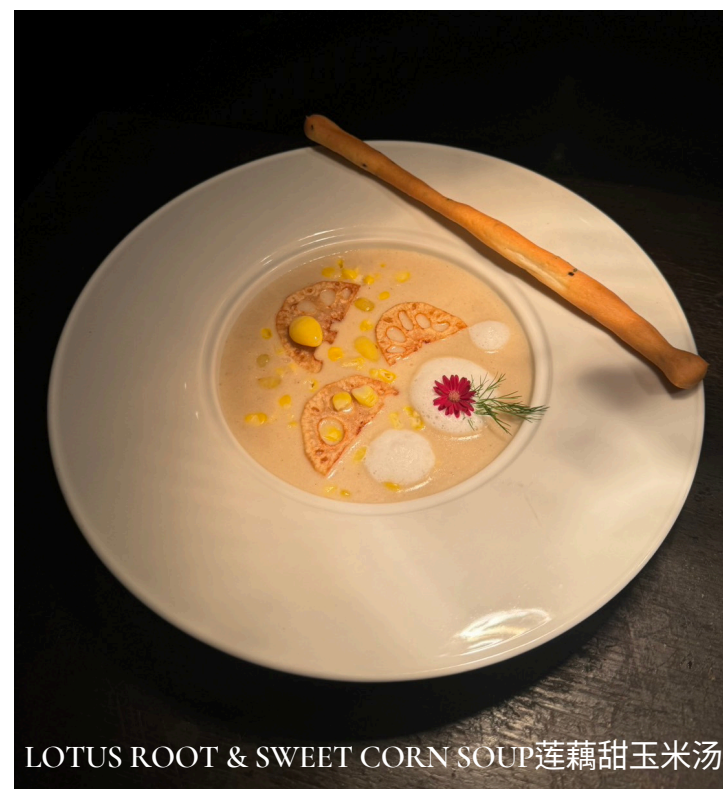
LOTUS ROOT & SWEET CORN SOUP 莲藕甜玉米汤