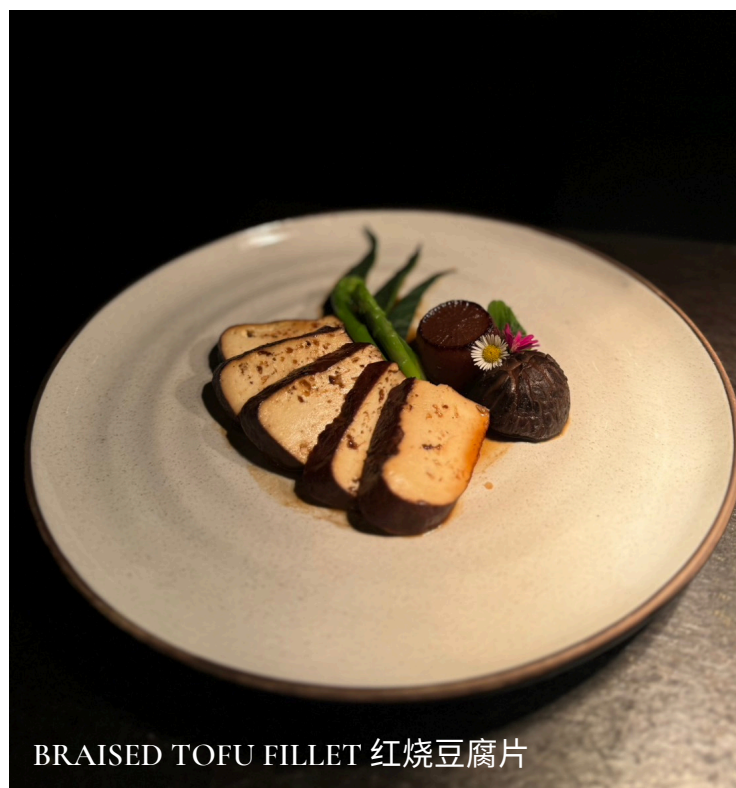
BRAISED TOFU FILLET 红烧豆腐片