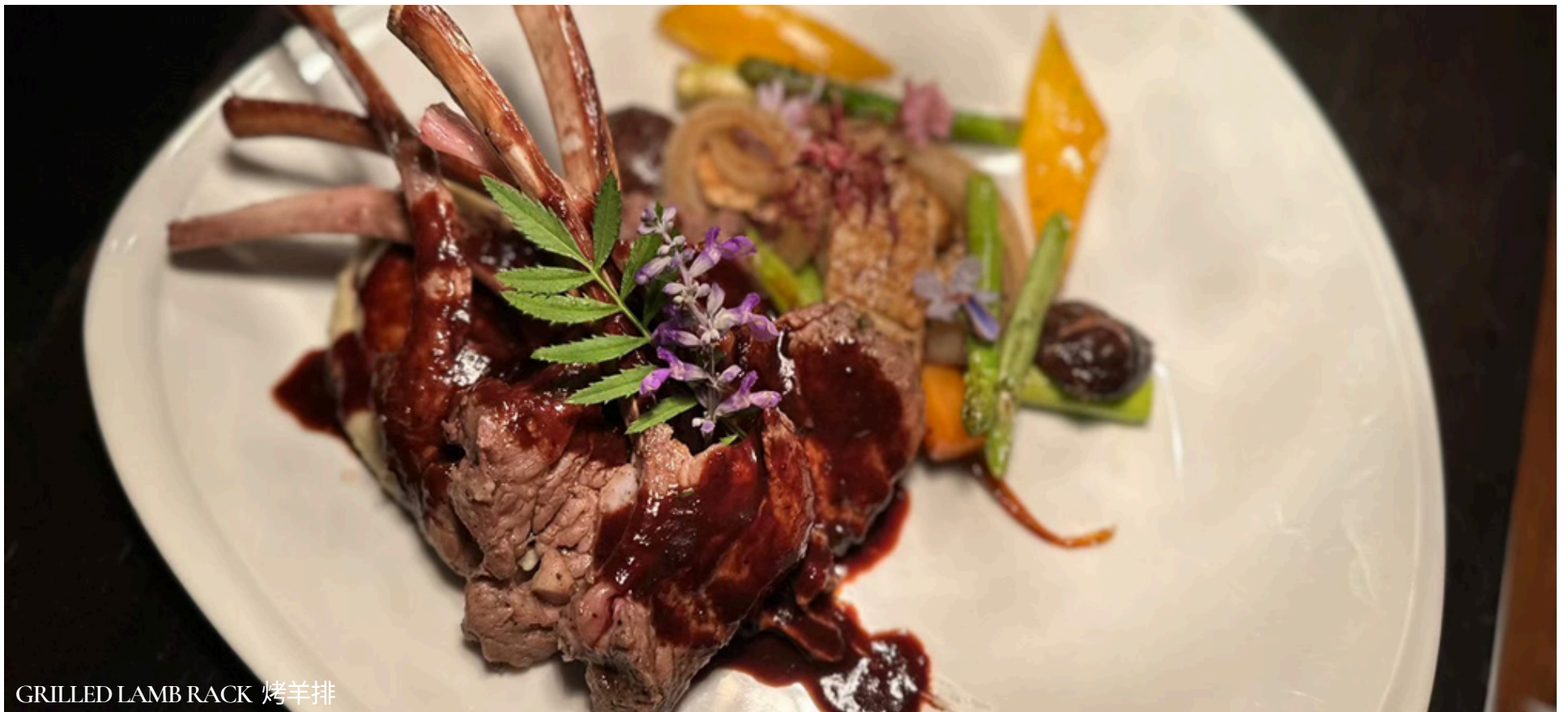
GRILLED LAMB RACK 烤羊排