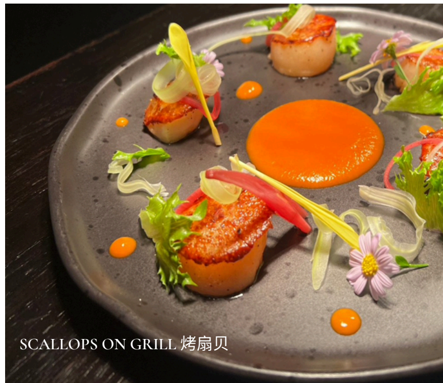
SCALLOPS ON GRILL 烤扇贝