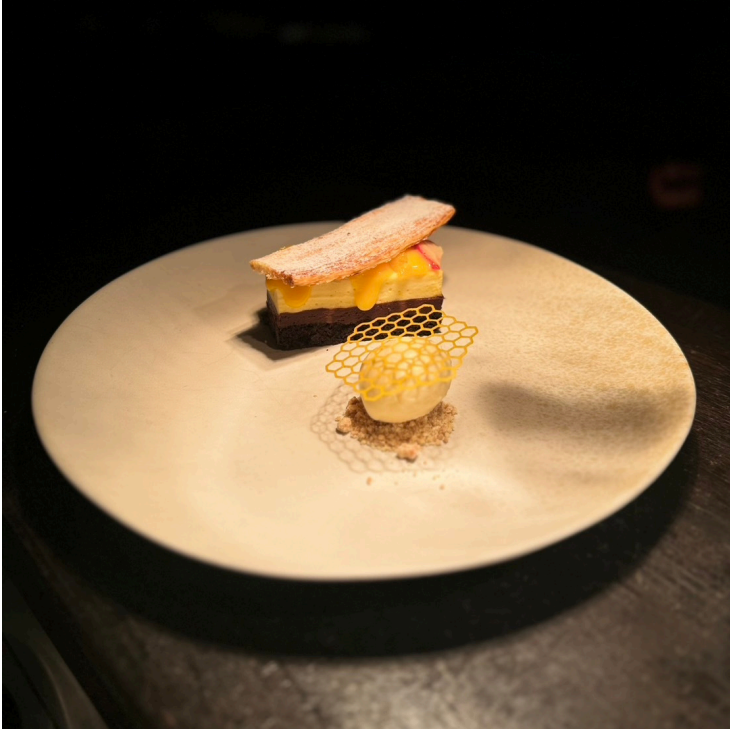
CHOCOLATE ORANGE CHIBUST 410 巧克力橙味奶冻 French pastry with chocolate and orange flavour 巧克力橙味法式糕点