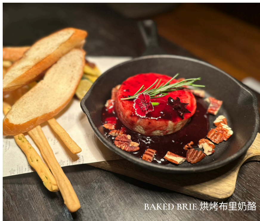
BAKED BRIE 烘烤布里奶酪