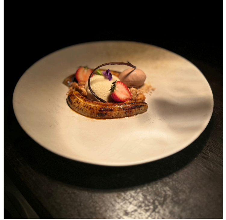
PEANUT BUTTER CARAMEL MOUSSE 410 花生酱焦糖慕斯 Nutella ice cream crispy banana, peanut candy 努特拉冰淇淋, 脆皮香蕉, 花生糖