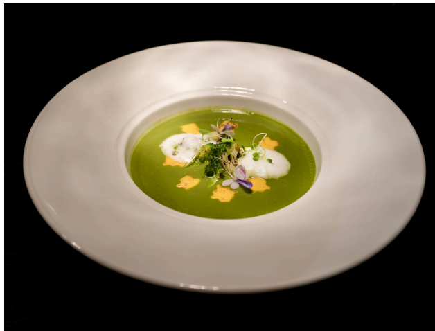
BROCCOLI CHEESE SOUP 西兰花芝士汤

Broccoli, blue cheese. 西兰花, 切达奶酪 THB 360